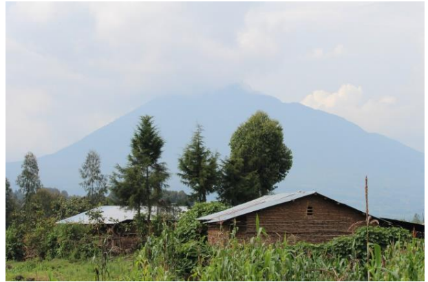
A majestic, though hidden, volcano near Musanze.

Apart from retracing the earlier trip up north in the bus on our way to Uganda, we also were able to visit our friends (& teammates), Chris & Fiona who live in Musanze – a large town in north western Rwanda. They took us to Gisenye, on the border of DRC, where the kids were able to swim in Lake Kivu. We also thoroughly enjoyed accompanying them to their village church & meeting the people they work with.