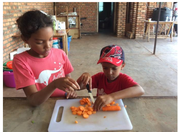
The kids were great about getting in there & helping out.