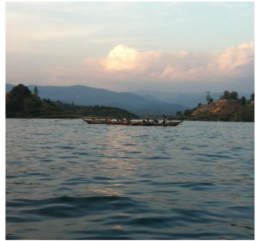
An evening boat ride on Lake Kivu.

The KICS staff retreat was held in Kibuye, on the shores of Lake Kivu (the same lake we visited in June, the biggest in Rwanda), about a 3-hour drive from Kigali (on great roads!). There really are no words to describe the beauty of that part of the lake. We enjoyed swimming & taking a boat ride to one of the islands; it was an incredible place which we are keen to visit again.