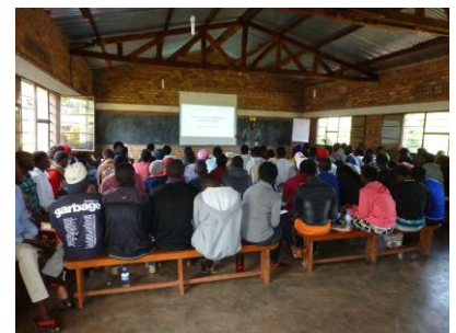
Campers in a teaching session