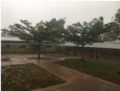
Those roof repairs were needed!