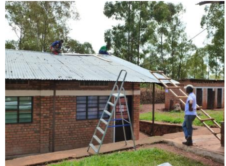
Pete oversees some roof repairs