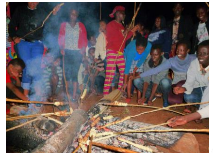
Dampers on a stick has become a tradition!