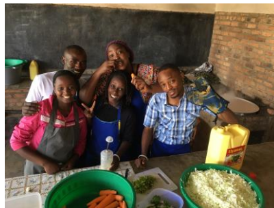
Our AMAZING kitchen team