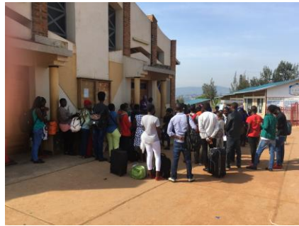
Campers gathered, waiting for the buses to get to camp