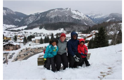
We all enjoyed the splendor & majesty (& snow!) of the French Alps.

January 20 th signals the beginning of ABO - Africa Based Orientation. It will be held in Nakuru, about a 3 hour drive from Nairobi. We are looking forward to the opportunity to learn more about AIM & to meet people at the same stage in the same process as us. Until then we are enjoying the opportunity to catch up with more family & many friends here in Nairobi.