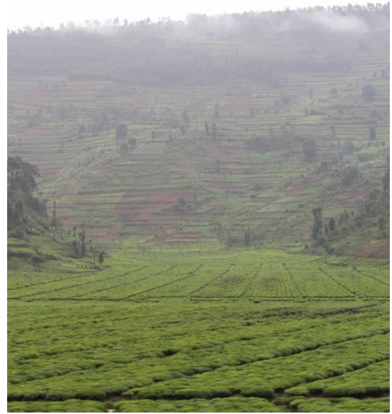
Even in the rain, the tea plantations surrounded by mountains near Byumba were spectacular.