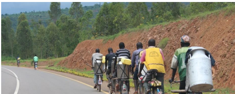
On the road to Byumba.