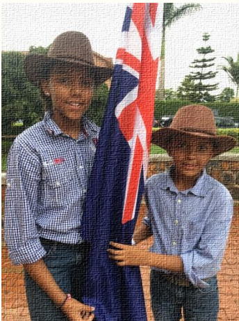
Representing Australia at the recent KICS Parade of Nations.