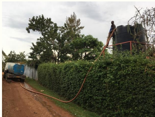
In the dry season we don't get as much city water sent through the pipes as at other times of the year. Usually we get water every 10 days or so, but this year during the dry season we were only getting water about twice a month. At the beginning of November our tank ran dry so we had to buy a truck load of water to re-fill it.