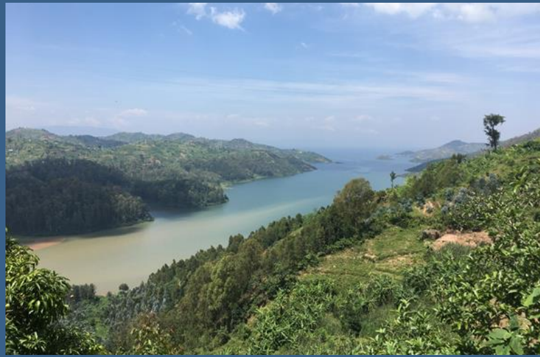
An inlet on Lake Kivu and the green hills of Nyamasheke District