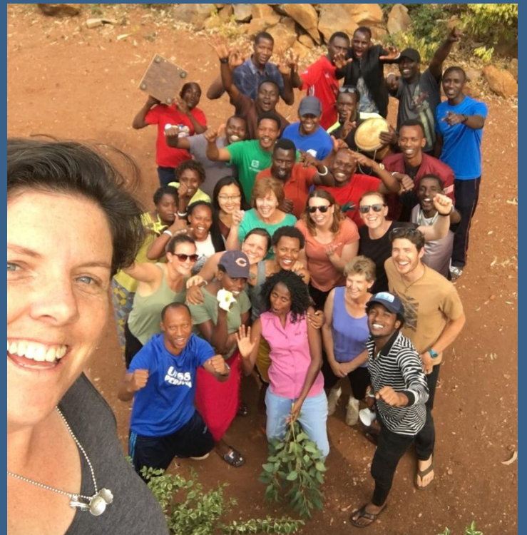
Forma'Camp19 Leadership Team

One of the most incredible stories from camp this year was that of a young dad who got a call part way through camp that he needed to return home as the bank was going to foreclose on his loan, seize his home and evict his family. It's a difficult call, for a multitude of reasons, to get involved in a situation like that, but the leadership team felt it important that we bring it to the camp community so they could pray for the young man. The campers took a collection – some of them giving all that they had – and their donations, combined with a contribution from one of our visiting leaders, was able to cover the cost of the young man's loan. We also had some incredible answers to prayer and donations that enabled us to replace a broken water pump.